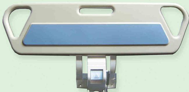
ABS jednodelna sa amortizerom OG 1-2