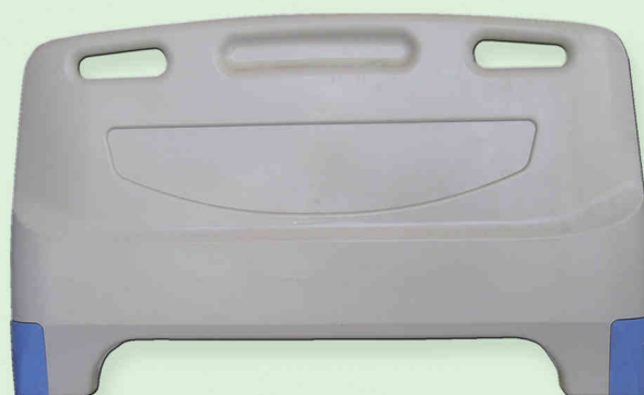
Stranica kod glave (višlja) Širina 95 cm x Visina 54 cm Side on head (higher) Width 95 cm x Height 54 cm