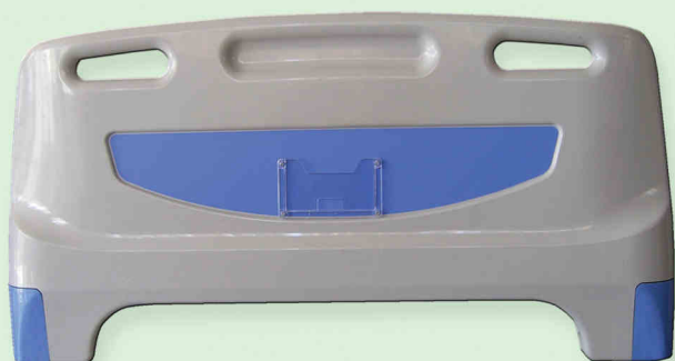
Stranica kod nogu (niža) Širina 95 cm x Visina 48 cm Side on legs (lover) Width 95 cm x Height 48 cm