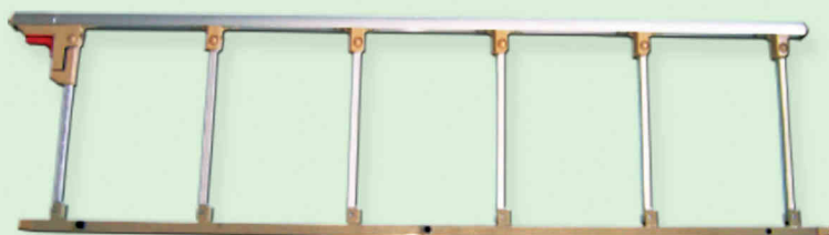
Aluminijumska obarajuća ograda OG 2 AL